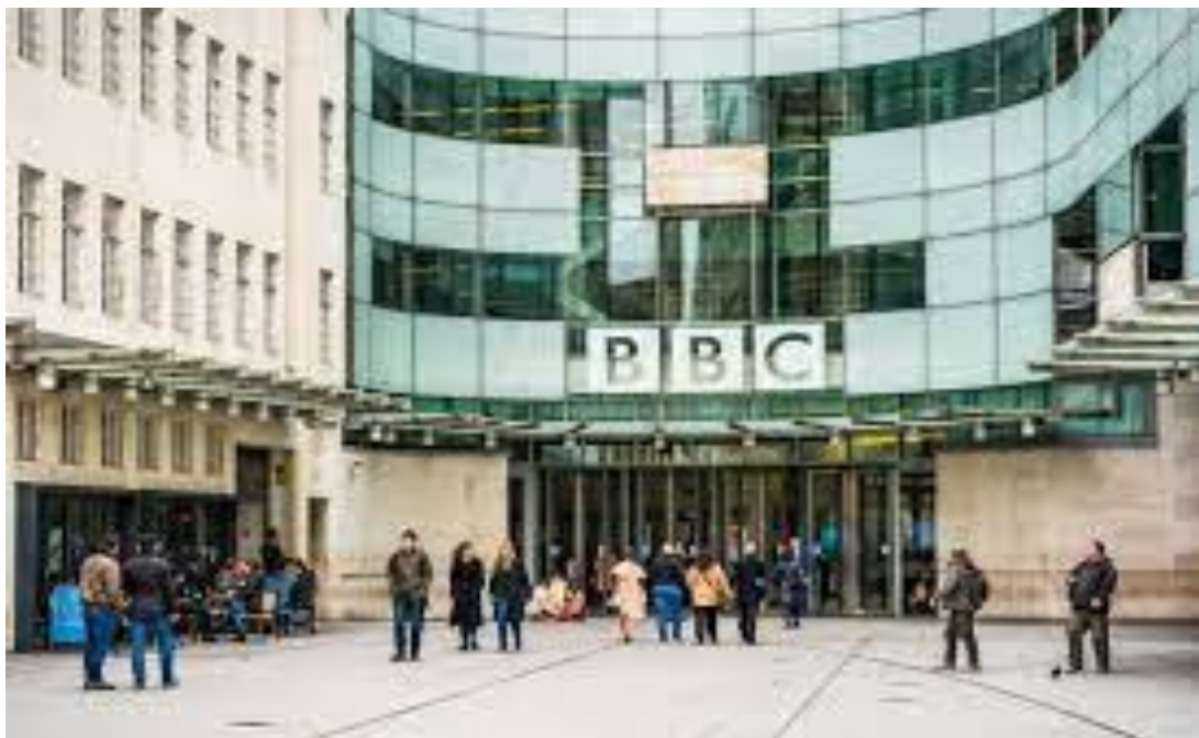
BBC Broadcasting House, Portland Place, London.