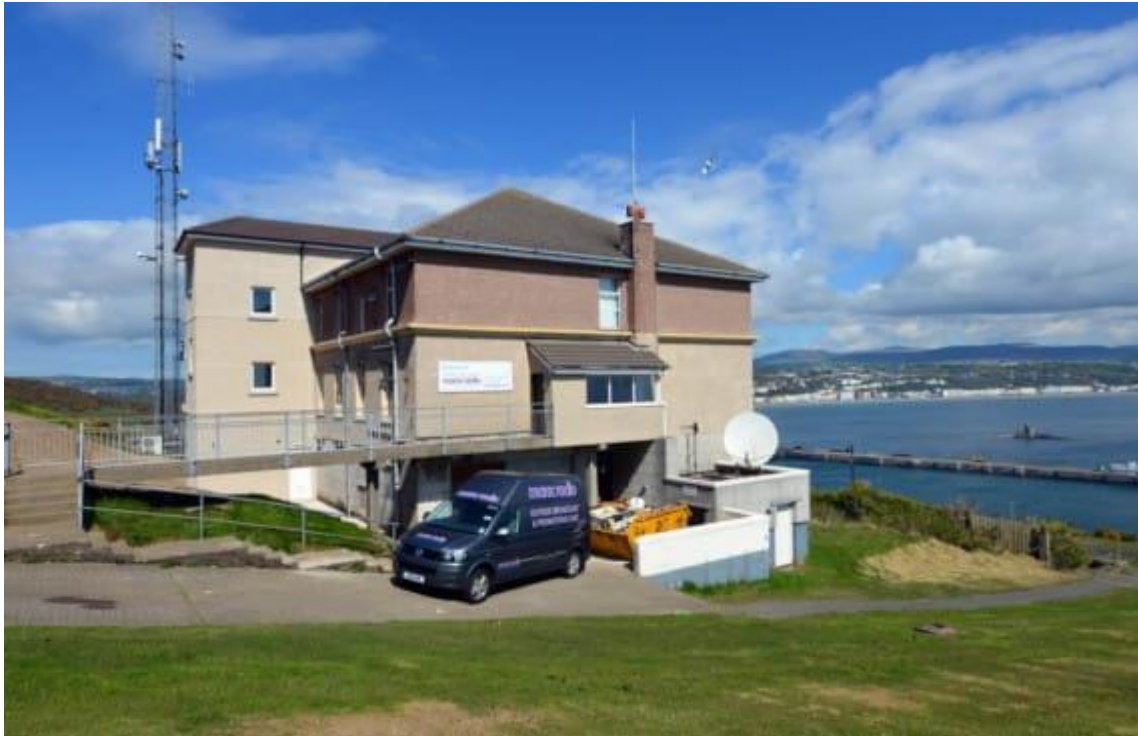
Manx Radio, Broadcasting House, Head Road, Douglas.

Clearly, such total does not include those who work behind the scenes in administration, secretarial, advertising, accounts and managerial roles.