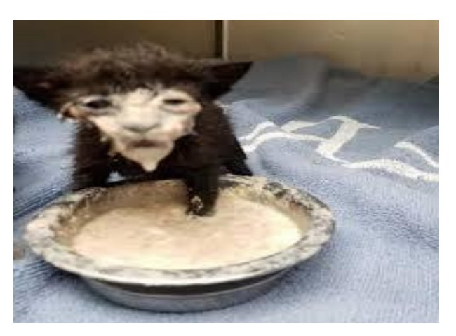
"It's free, so why not stuff my face?"

It transpires that <u>68</u> persons work for Manx Radio, with a total annual staff remuneration of £1.3 million.