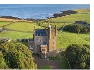
10. Castle Mey, North Coast Scotland