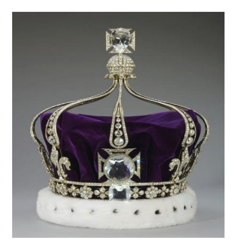
Fit for a Queen but is she fit for a crown?

She will sit on a red throne embroidered with gold thread depicting her brand new Coat of Arms. Camilla will hold an Orb and Sceptre and be cloaked in a purple velvet robe and will have a ruby ring put on her finger.