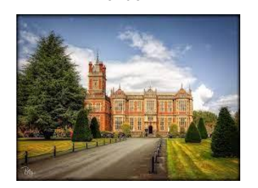
5. Duchy of Lancaster