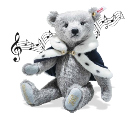
You can cuddle Charlie every night.

Of course, the Coronation has provided abundant consumer opportunities for canny retailers such as Marks and Spencer (where a 5 pack of Mens' Coronation socks embroidered with designs including a King Charles Spaniel, a lion, Union Jack flag, unicorn and a crown are a snip at £14.00), Fortnum and Mason (where a Coronation Christmas tree bauble is selling for a whopping £50.00), Selfridges (where a container of Coronation popcorn is £25.99) and ardent royalists can even buy a Steiff Coronation teddy bear (for an eye-watering £259.00 but he does come with a purple robe, felt paws and charmingly plays God Save the King when squeezed).