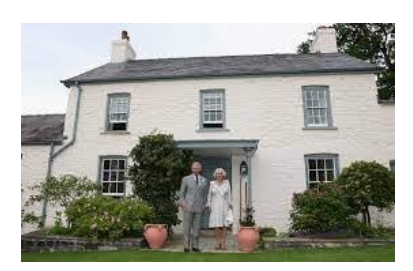
14. Llwywermod House, Carmarthenshire, Wales

Also consider his many dozens of titles which include the following:-