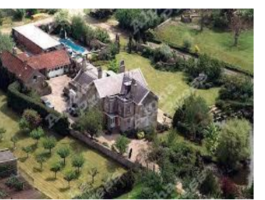
11. Ray Mill House, Costwold