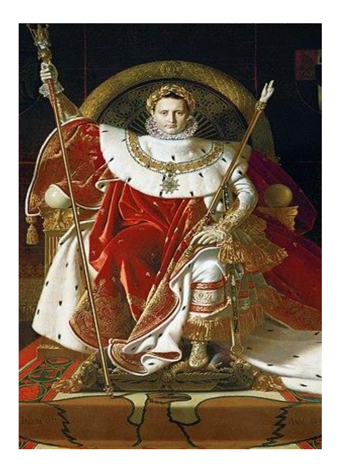
Coronation as propaganda.

When Napoleon Bonaparte was crowned Emperor in 1804, the French artist Ingres was commissioned to paint his portrait.