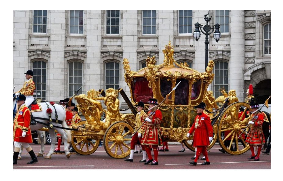
It sure beats using the Tube.

Tomorrow, the eve of the Coronation, the King will host a lavish reception in the ballroom of Buckingham Palace for approximately 1,000 VIP guests. On Sunday 7<sup>th</sup> May 2023, the so-called Coronation Big Lunch takes place in many towns and villages across the UK where residents are being encouraged to hang out patriotic bunting and join in community commemorative meals. This will be followed by a Coronation Concert at Windsor Castle on Sunday evening with pop stars such as Olly Murs performing.