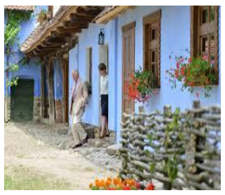
12. The Blue House, Transylvania, Romania