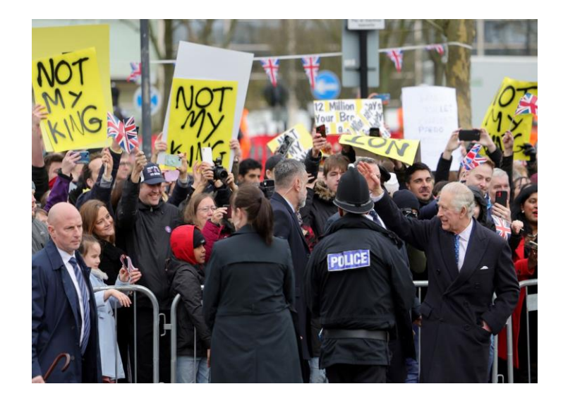
The tide of public opinion is turning.

These peaceful protesters will be exercising their legal rights protected under the European Convention on Human Rights including Article 9 (the right to freedom of thought, conscience and religion), Article 10 (the right to freedom of expression) and Article 11 (the right to freedom of assembly and association).